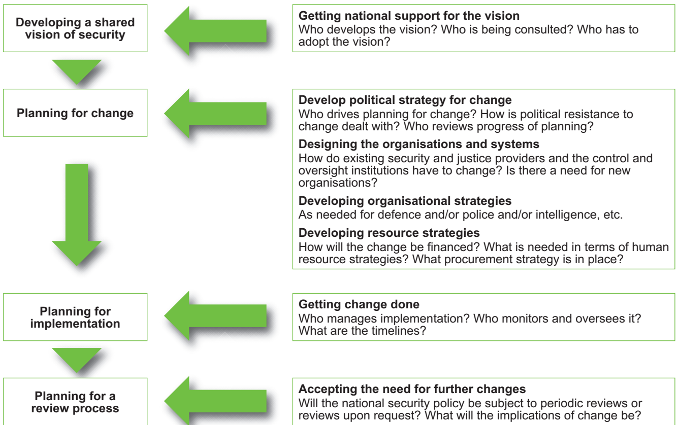
Figure 1: Questions to ask when developing security policies 3

and justice. Non-state security actors should therefore be included in processes of developing and implementing security policies.